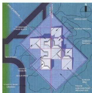
Figure 4. Composite Plan showing the nine CAR pattern language bundle

Anchored on the syllogistic nature of logical argumentation (Groat and Wang, 2001) as defense against all possible disagreements, the "formal/ mathematical" aspects of the study was done thru lexicostatistical processing and thermodynamic analysis for language and architecture respectively. The "cultural" aspects of the study were carried out with advocacy treatises. And the conjoining dimension in between the quantitative phase of the forma/ mathematical vis-à-vis the qualitative phase of the cultural was carried out with the architectural design procedures of kit of parts, shape grammar and pattern language.