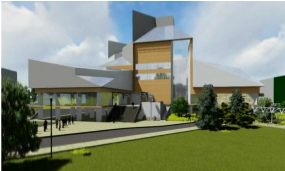
Figure 6. Application of the Architectural Anthropology Study in Urban Design Scale: A Proposed Cordillera Cultural Center as Social Infrastructure for Baguio City, Philippines

Individual heights of the individual ethnic groups' assigned block was determined by values arising from the architectural anthropology extract multiplied by population figures.