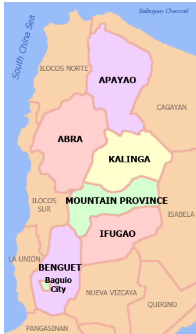
Figure 3. Administrative Map of CAR (Cordillera Administrative Region) in the context of Northern Luzon.

The native dwellings of the culture groups symbolized a historical aspect of the respective ethnic groups where they belong (Waterson, 1993). Language on the other hand being in active use in present times by the ethnic groups symbolizes a descriptive aspect of their intangible cultures. The resultant architectural anthropology values produced from the fusion of the native dwelling values with the anthropology values thru architectural programming produced a building form that subsumed the collective cultures of the nine culture groups. This architectural design phase represented the experimental phase of the study. The architectural outcome therefore- like the native dwellings and the languages of which it was borne out of- aspired to convey messages evocative of the C.A.R. community it represented.