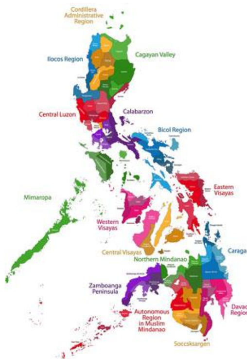
Figure 2. Map showing CAR in relation to the other Philippine regions.

Interdisciplinary research increasingly reinforce the Austronesian concept of population migrations to the Philippines from a northern origin (Blust), which provided the genesis of the CAR and Igorot peoples of northern Luzon.