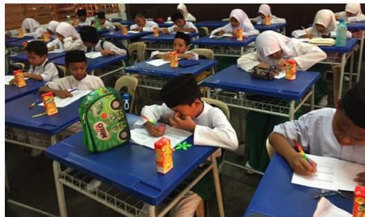
Figure 2: A total of 287 students from KAFA Primary Schools participate in the survey

To identify students for the game design workshop phase, purposive sampling was used in the initial study phase as shown in Figure 2. The purposive sampling purposely identified eligible students for the next stage for the PD process. After the purposive sampling was done, the collected data will be forwarded to the next phase of the game workshop setting. In this phase, we will sort the data collected and triangulate the eligible students with their examination results. We have various participants with unique education backgrounds and game design preferences. The triangulation of game design preferences and examination results background will be done later in the second phase of PDEduGame.